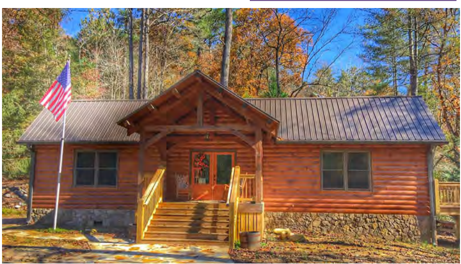
The BMA/REE associations' office was completed in May 2018.

This is a general proxy and gives the holder the authority to cast votes on your behalf on any matter that requires a vote at the meeting. This year's annual meeting will be held on Saturday, December 1, 2018, at 9:30 am at United Community Bank's Community Room located at 558 Industrial Blvd.