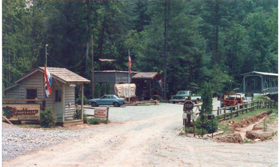
The entrance to Blackberry Mountain in the mid-1980s. Blackberry has changed with time, but remains physically and fiscally sound by adhering to the mission set forth over thirty years ago.

Included in the packet with this newsletter you will find the proposed budget for FY2012, a proxy and an opt-form for Hemlock Woolly Adelgid property inspection.